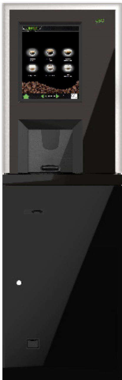
JBC 550 with BLACK CABINET