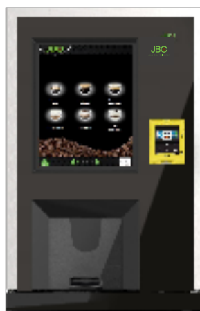
JBC 550 EASY

JBC 550, automatic vending machine with 200 cups capacity, available in espresso coffee from beans and instant coffee.