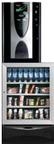
LEI 200 + VISTA S