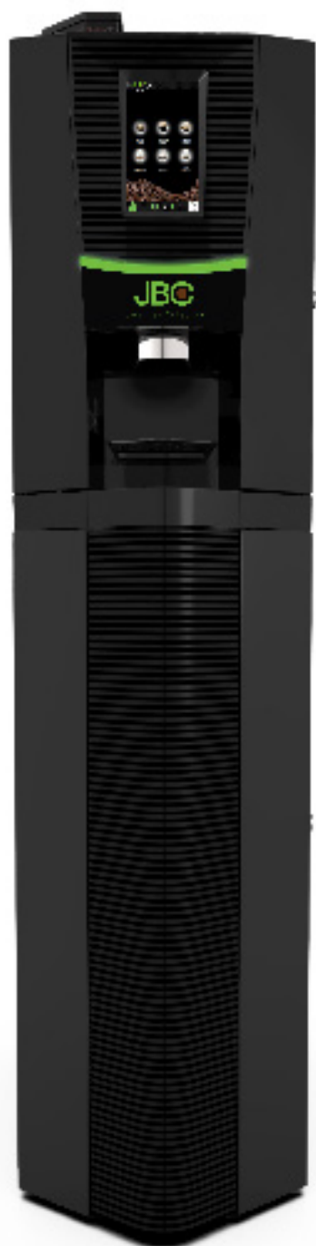
JBC 350 with BLACK CABINET